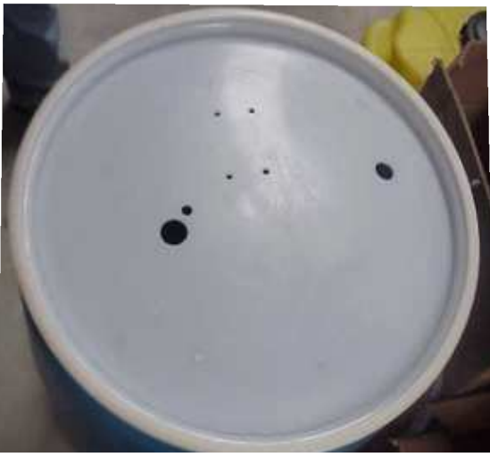
1. Drum comes with holes pre-drilled in the lid