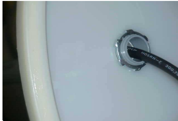
4. Feed float cord through pre-drilled hole on lid and attach PVC using supplied nut