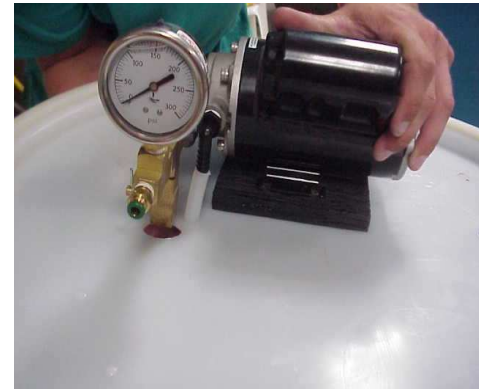
5. Align motor with predrilled holes and use 1/4 in bolts to secure to lid