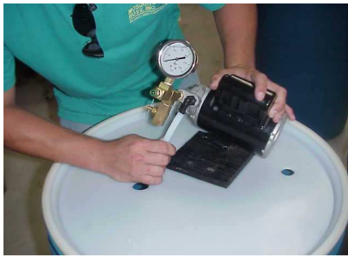
3. Feed suction line (attached to PVC) through pre-drilled hole and attached to barbed 90