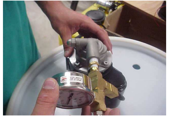
2. Screw gauge assembly onto motor