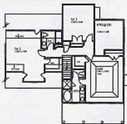
second floor plan