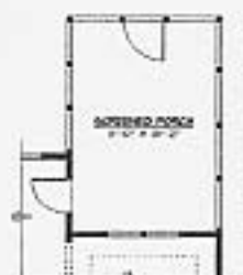
Optional Screen Porch