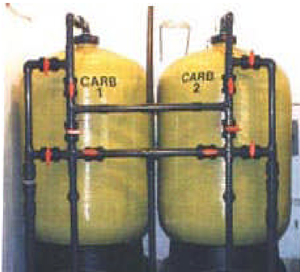
Fiberglass Filters with Manual Valves

**AquaPure systems are site specific. Please contact our office for design and pricing.**