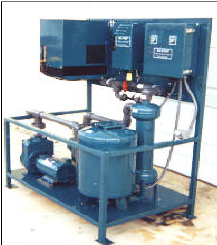
Injected into recycled water in a car wash