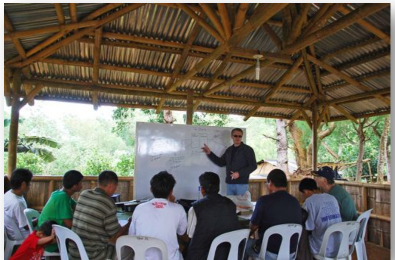
Bible Study in the mountains

Yes, we even have an American gentleman that attends the Bible study!