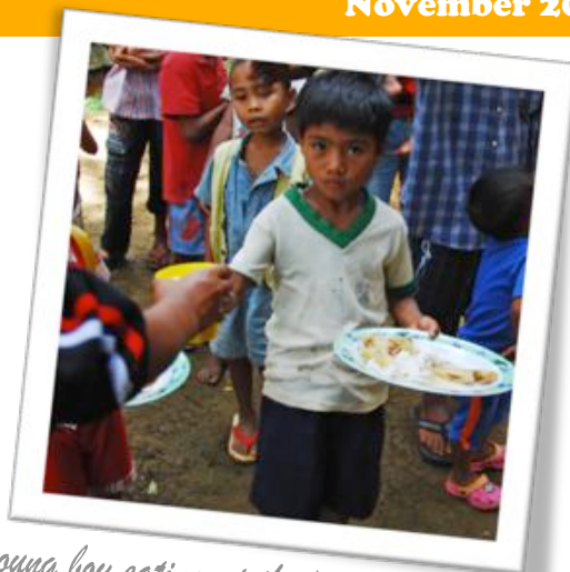
A young boy eating at the feeding program.

It is easy to see that blessing has followed the establishment of a legal presence in this area.