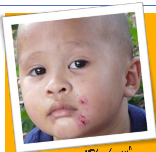
He says "Thank you".

She is now in training for the regional track competitions ... barefoot!