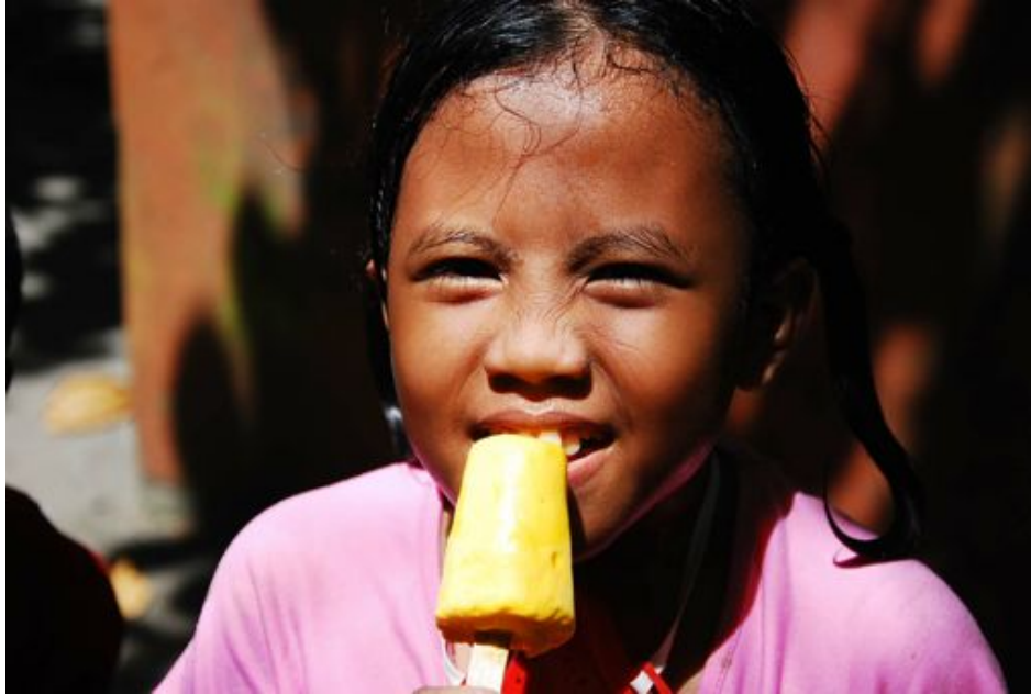
Small Things Bring a Big Smile...