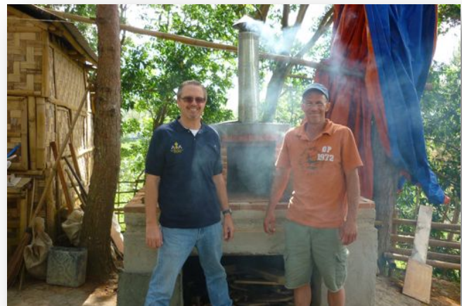
Helping with the physical needs of the destitute of the community.

This turned out to be a bigger project than we anticipated and we are so grateful for all those that came around us to ensure successful completion.