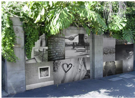
Above: Footpath Gallery , St Kilda

Grey Street, in the heart of St Kilda, is being revamped into a public art gallery thanks to the creative genius of the Footpath Gallery. The Footpath Gallery organises for the ladies from the Sacred Heart Mission Women's House to go on photographic excursions in the surrounding area. Each week for 6 months, participants produce black and white images as a result of their excursions. This finished artworks are then mounted directly onto the wall in Grey Street for the viewing pleasure of local residents and passersby.