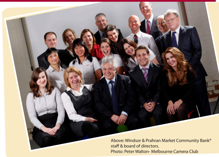
Above: Windsor & Prahran Market Community Bank ® staff & board of directors.

All eligible applicants are encouraged to apply (what have you got to lose?!) See www.windsorcommunity.com.au for more information.